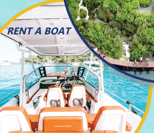
RENT A BOAT